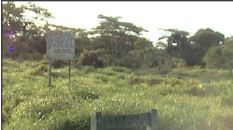
Figure 8 Entrance to Lake Lanoto'o (old signboard, no proper carpark and unclear trail due to overgrown lawn)

Monitoring and evaluation of the project progress shall be conducted by the CCC and Project Coordinator, however to successfully deliver this output, a 4WD project vehicle is critically needed for