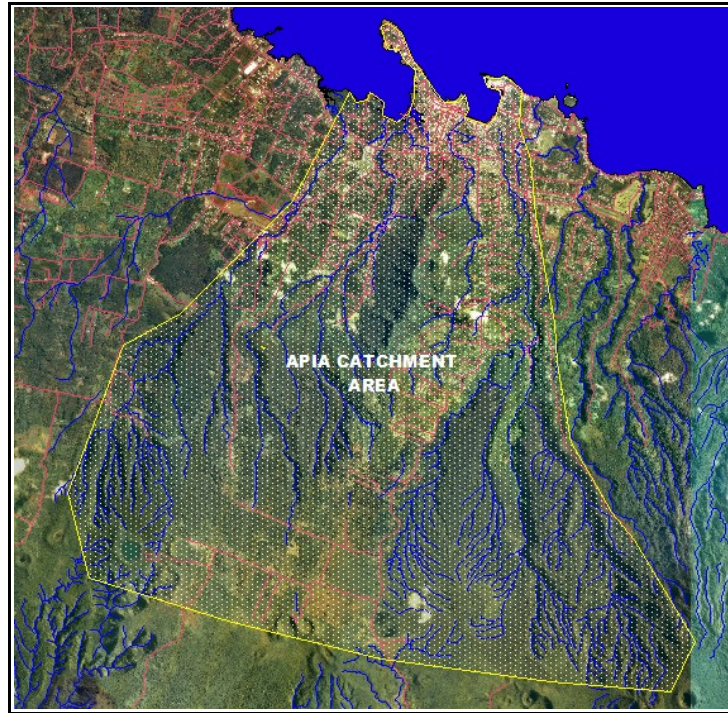
Figure 2 Topographical Map of Apia Catchment