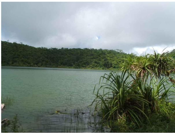
Figure 10 Lake Lanoto'o