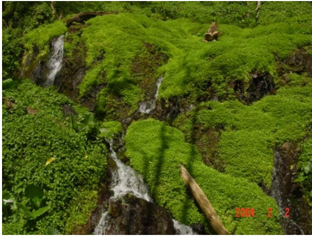
Figure 9 Loimata o Apaula