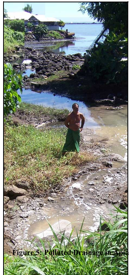
Figure 5: Polluted Drainage in Apia

The Fuluasou subcatchment covering 4500 hectares (45 km 2 ) is located south west of Apia and supplies drinking water to the North-West Upolu and a part of Apia. Major agricultural activities (cattle farms, taro, banana and vegetable productions) occur in this area and pose some problems to the residential and urban areas through erosion caused by the cultivation of steep slopes and threatened water supply quality from the use of pesticides. 3