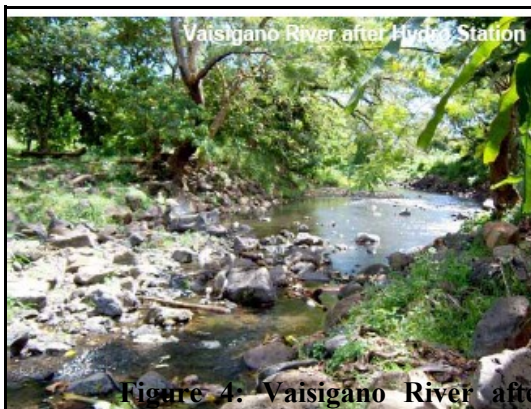
Figure 4: Vaisigano River after

The Vaisigano subcatchment, located in the North Central Upolu Island near the growing capital city of Apia, covers an area of 3400 hectares (34 km 2 ) and is being tapped to meet the increasing demands of drinking water and hydropower for the capital city and its surrounding villages. Problems such as siltation is causing interruption to power generation and water supply, while adversely affecting the natural and built-up environments and threatening thriving inland and coastal eco-systems. 2