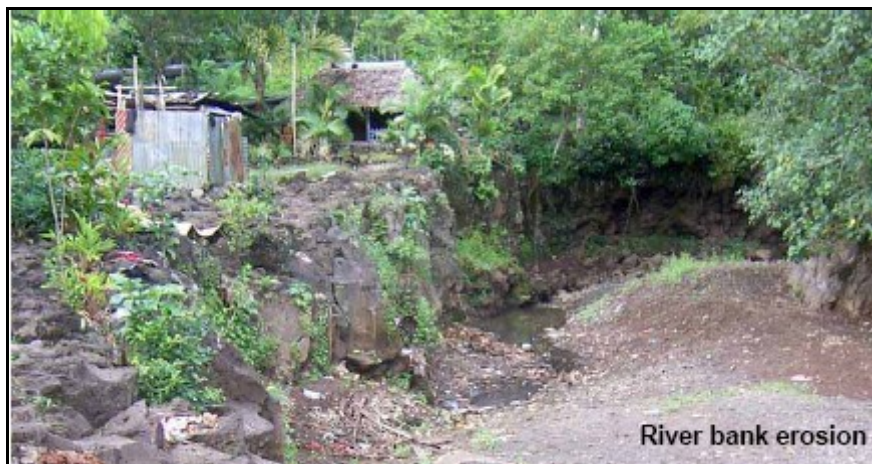
Figure 6 Erosion of river bank

Consistent with the concept that any anthropogenic changes to hydrological processes in any one place has potential impacts to all downstream users, considerable emphasis is being attributed to conservation and rehabilitation measures in