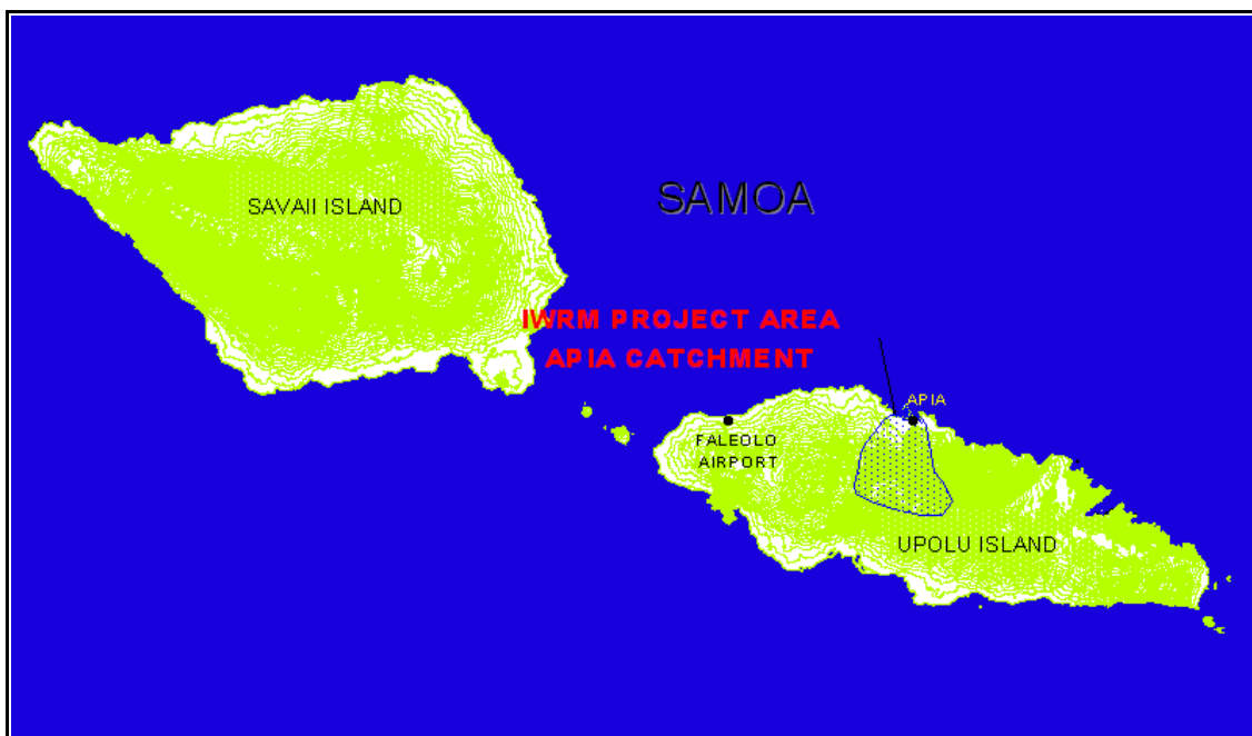
Figure 1 Map of Samoa with Apia Catchment identified on Upolu

Located on Upolu, the Apia catchment covers 85km 2 and includes Lake Lanoto'o and its two subcatchments, Vaisigano and Fuluasou. It is essential for the provision of water supply as well as hydropower generation to Apia - Samoa's capital city. This urban area is densely populated (approximately 45% of Samoa's 178,000 population 1 ) and serves as the country's principal centre of administration and commercial activity. All surface water from this catchment drains into the Apia town area, which constitutes a large floodplain.